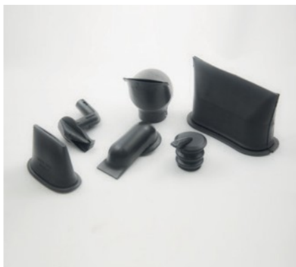
CONDENSATE DRAIN PIPES