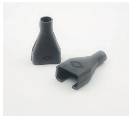
ITEM FOR WIRINGS