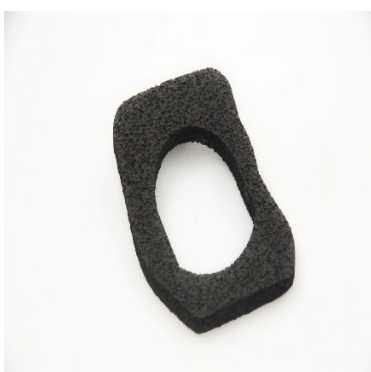
GASKET IN EXPANDED MATERIAL