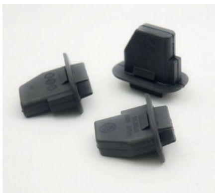
FIXING RUBBER ITEMS