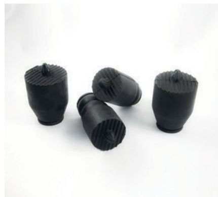
VIBRATION DAMPINGS FOR SUSPENSION SYSTEM