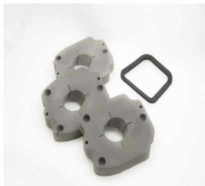
GASKETS IN EXPANDED MATERIAL