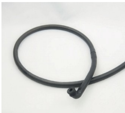
FUEL VAPOR PIPE AND FITTING