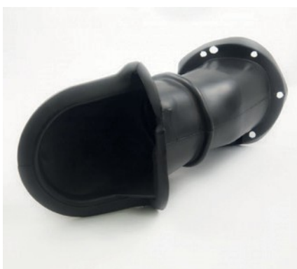
FUEL INJECTION SYSTEM GASKET