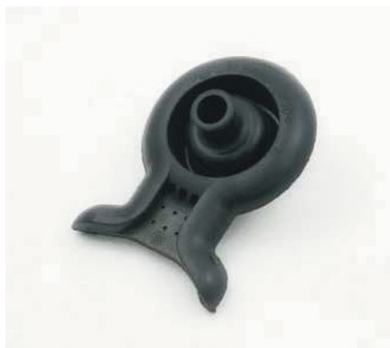
ITEM FOR WIRING