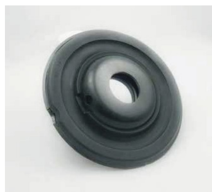
VIBRATION DAMPINGS FOR SUSPENSION SYSTEM