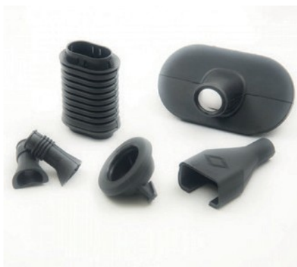
ITEM FOR WIRINGS