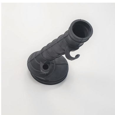
MOTORCYCLE FILTER BOX