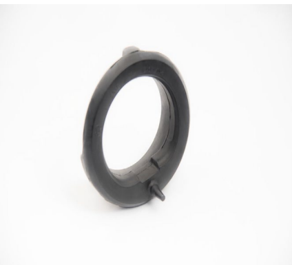
VIBRATION DAMPINGS FOR SUSPENSION SYSTEM