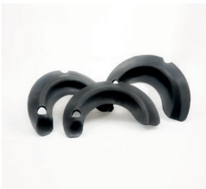
VIBRATION DAMPINGS FOR SUSPENSION SYSTEM