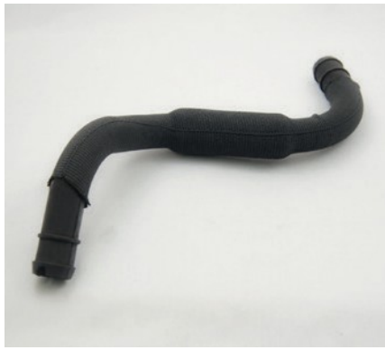
VAPOR TUBE WITH PROTECTION SHEATH