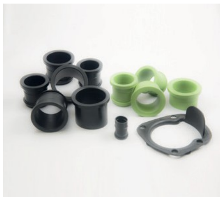
FUEL INJECTION SYSTEM GASKETS