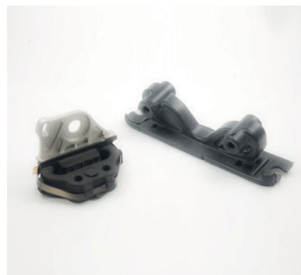
INSERT FOR MUFFLER SUPPORT