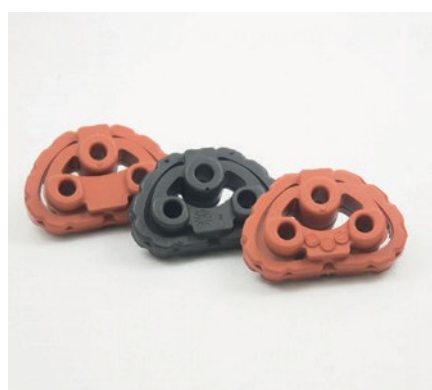
INSERT FOR MUFFLER SUPPORT