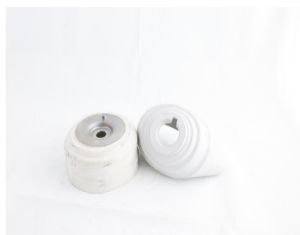
HEAT PROTECTION CUP