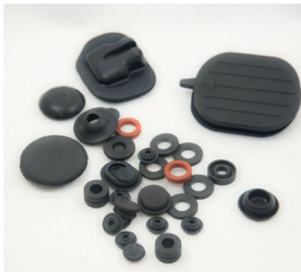
HOLE PLUGS AND GASKETS