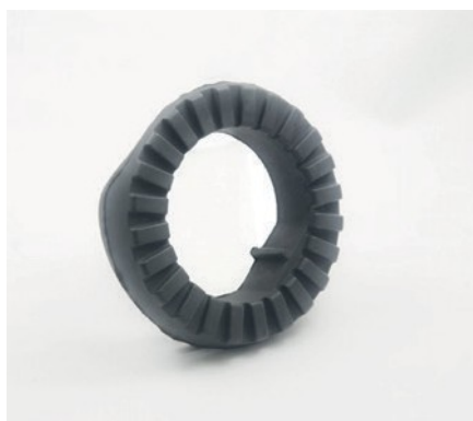
VIBRATION DAMPINGS FOR SUSPENSION SYSTEM