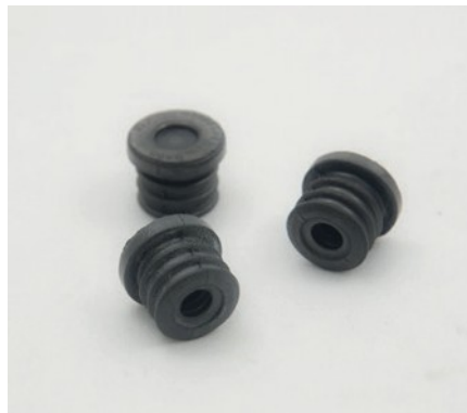
GASKETS FOR OIL DIPSTICK