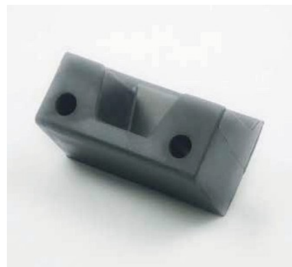
RUBBER STOP BUFFER