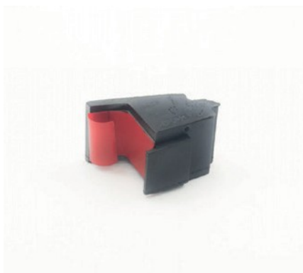
BUFFER FOR LIGHTING COMPONENTS WITH ADESIVE