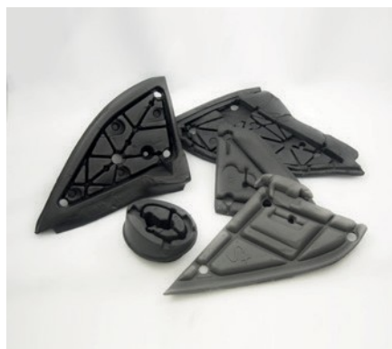
GASKETS FOR REARVIEW MIRRORS