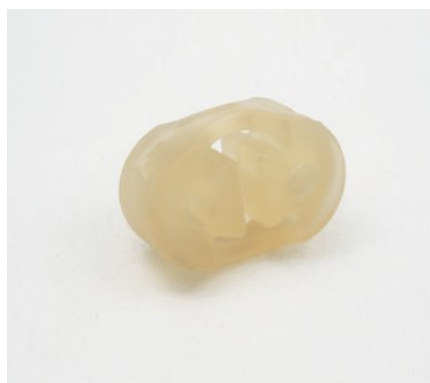
INSERT FOR MUFFLER SUPPORT