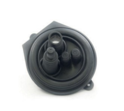
ITEM FOR WIRING