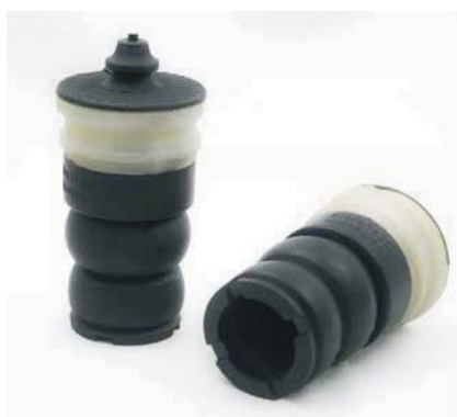
VIBRATION DAMPINGS FOR SUSPENSION SYSTEM