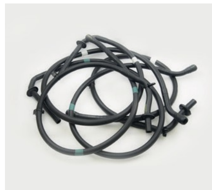
WATER DRAIN PIPES AND FITTINGS