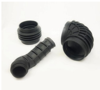
BIG DIMENSION BELLOWS FOR INDUSTRIAL VEHICLES