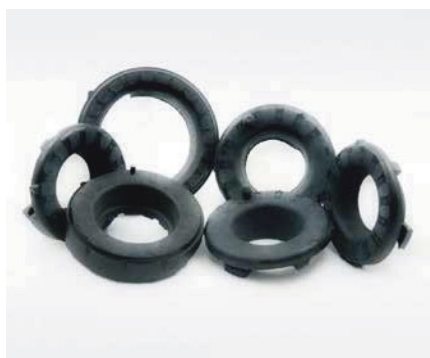
VIBRATION DUMPINGS FOR SUSPENSION SYSTEM