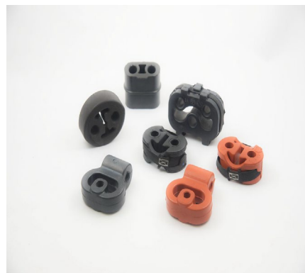
INSERTS FOR MUFFLER SUPPORT